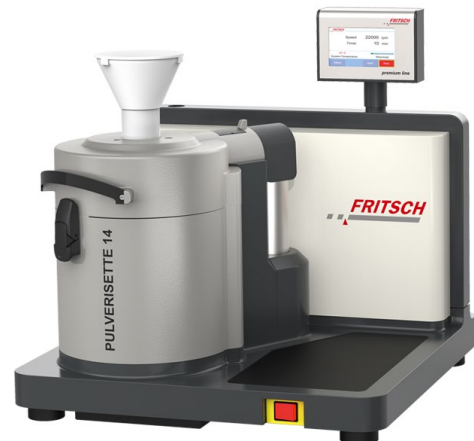
Fig. 2: Variable Speed Rotor Mill PULVERISETTE 14 premium line

We programmed the maximum speed setting of 18000 rpm and used a batch of 200 g of the dog food. The sample was fed slowly and was ground within 1:40 minutes. The grinding sound was typical during the grinding process.