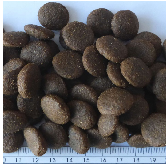
Fig. 1: Sample of dog food

Hence the importance of continued pet food testing for various ingredients or to even prevent contamination due to aflatoxin or salmonella. New technologies and testing methods for example are helping manufacturers and vet supply chains to keep products safe. FRITSCH Mills are perfectly suited for sample preparation prior to further testing of pet food.