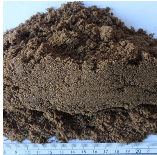
Fig. 4: Sample output sieve shell 4 mm