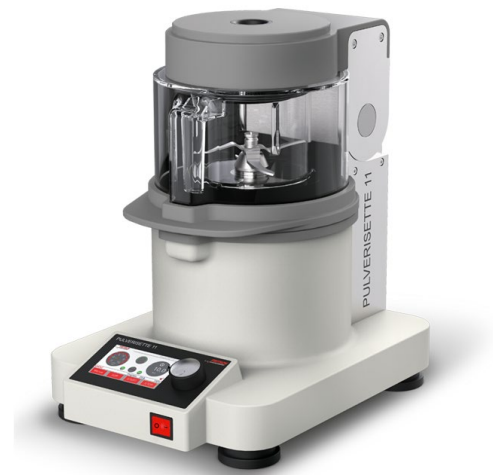
Fig. 5: Knife Mill PULVERISETTE 11

The majority of the sample was ground much finer than the requested 1 mm. Like in our first trial, the surfaces which were in contact with the ground sample, were covered with a small amount of the grease or oil.