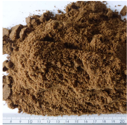
Fig. 7: Ground dog food after 20 seconds of grinding

In summary: Both systems avoid sample heating and loss of analytes.