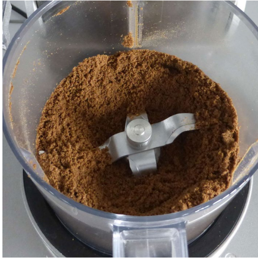
Fig. 6: View inside standard grinding vessel