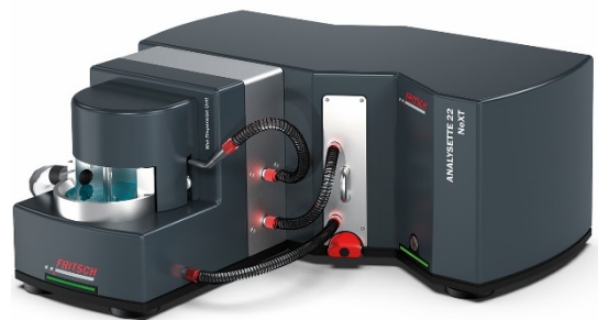
Fig. 1: Laser Particle Sizer ANALYSETTE 22 NeXT

FRITSCH’s innovative laser particle size analysers use a reverse Fourier optical system — pioneered and patented by FRITSCH more than 35 years ago — to deliver precise size characterization of materials down to the low-nanometre range