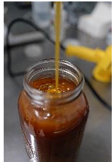
Fig. 7: Cannabis oil

They continue to think and work as a family business, crafting precision German-made instruments with extensive in-house production expertise. In fact, the firm’s leaders continue to invest into future product development, making sure today’s clients and customers are effectively prepared for tomorrow’s challenges.