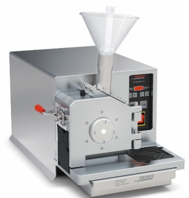
Fig. 6: Universal Cutting Mill PULVERISETTE 19

The performance of the PULVERISETTE 19 is highly reproducible regardless of the end user’s individual expertise. Its high-throughput system enables continuous processing one to five pounds of material per minute, on average. The mill is dust-free and easy to clean. Its Cyclone separator also provides effective heat mitigation, preventing resin build-up and maintaining the integrity of the final extract or plant product. The US cannabis industry has rapidly grown from a collection of small start-ups to a collection of vertically integrated, scientifically minded firms.