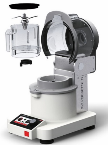
Fig. 5: Knife Mill PULVERISETTE 11

The PULVERISETTE 11 capacity has a full range of < 10 ml to 1400 ml, easily managing most any difficult sample — wet, dry, moist, tacky, hard, or fibrous — with disposable and reusable grinding set configurations. It can also handle samples up to 300 + grams of flower, leaf, seed, and edible samples up to 30 + grams, utilizing single-use grinding vessels in a range of < 10 ml-100 ml volume. This powerful knife mill also provides the ability to create and save standard operating procedures (SOPs) — greatly reducing the time investment of reprogramming and reconfiguring the instrument during alternation between different grinding procedures.