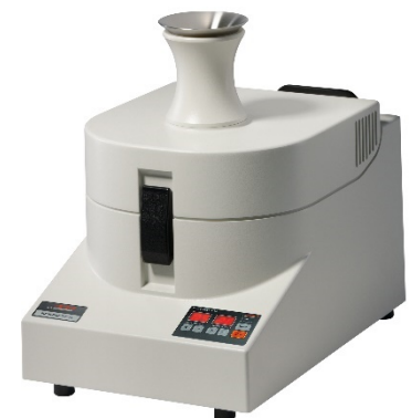
Fig. 4: Variable Speed Rotor Mill 14 PULVERISETTE 14 classic line

All of the contact surfaces are composed of stainless steel — or food-grade plastic vacuum hose for the Cyclone — and are easy to clean thoroughly between batches, reducing the likelihood of cross-batch contamination. A variable-speed motor and a range of sieve rings provide full control over particle size output, offering options to grind plant material more coarsely or more finely, depending on the specific application for which each batch is intended