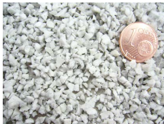
Fig. 3: Comminuted sample with 4\text{ mm} sieve

Due to positive experiences with other elastomers, part of the sample was mixed with dry ice and comminuted with the use of the 4\text{ mm} sieve. This was possible without any problems. It is to be noted, that the silicone rubber, despite being cooled, remained elastic. The comminution in the second test was just as easy.