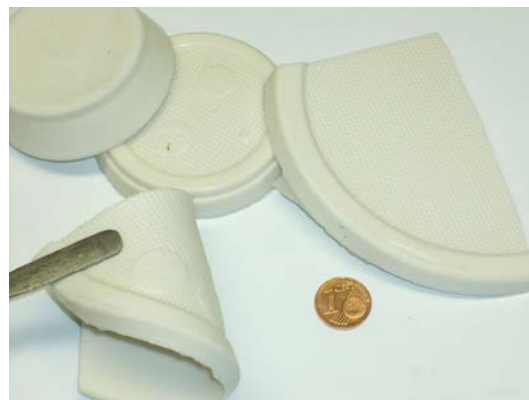
Fig. 1: Silicone rubber sample

The material is very elastic. Therefore the first assumption was that a comminution is only possible with cutting mills and cooling with dry ice is mandatory.