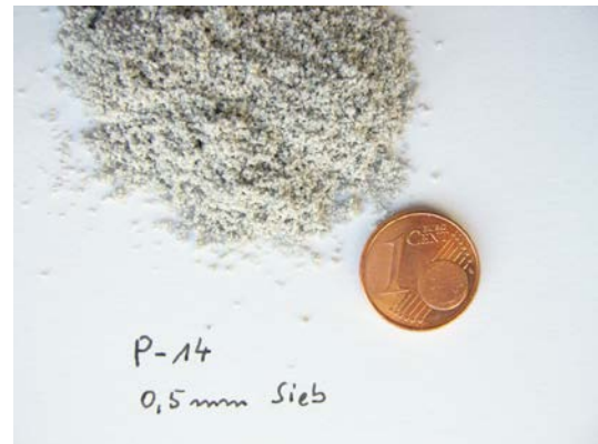
Fig. 5: comminuted silicone rubber with 0.5 mm sieve

Since the desired final fineness could not be obtained in this manner, in the next attempt, the Variable Speed Rotor Mill PULVERISETTE 14 classic line with a 0.5 mm sieve was utilized. Used was the previously comminuted down to 4 mm material (comminuted without cooling with the Universal Cutting Mill PULVERISETTE 19). For this attempt, the material was not cooled with dry ice. Without any difficulty, with this mill, silicone rubber could be comminuted with the sieve throughput of 0.5 mm.