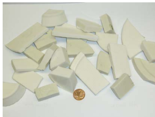
Fig. 2: Manually comminuted silicone rubber

For analytical amounts a manual pre-comminution is possible. The in the example prepared sample was now additionally comminuted with the Universal Cutting Mill PULVERISETTE 19 .